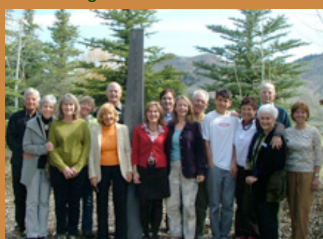
Light on the Mountain Backpack Volunteers

The Backpack Club is here to make sure the kids in Blaine County can experience childhood, not hunger. By providing children with healthy, easy-to-prepare foods every Friday, kids can get through the weekend and back to school on Monday ready to learn, and play. With your support, we are giving them a better today, and brighter tomorrow!