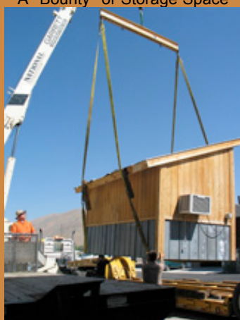
A "Bounty" of Storage Space

Learn more about Idaho's Bounty and our partnership in bringing wholesome, locally grown food to the hungry.